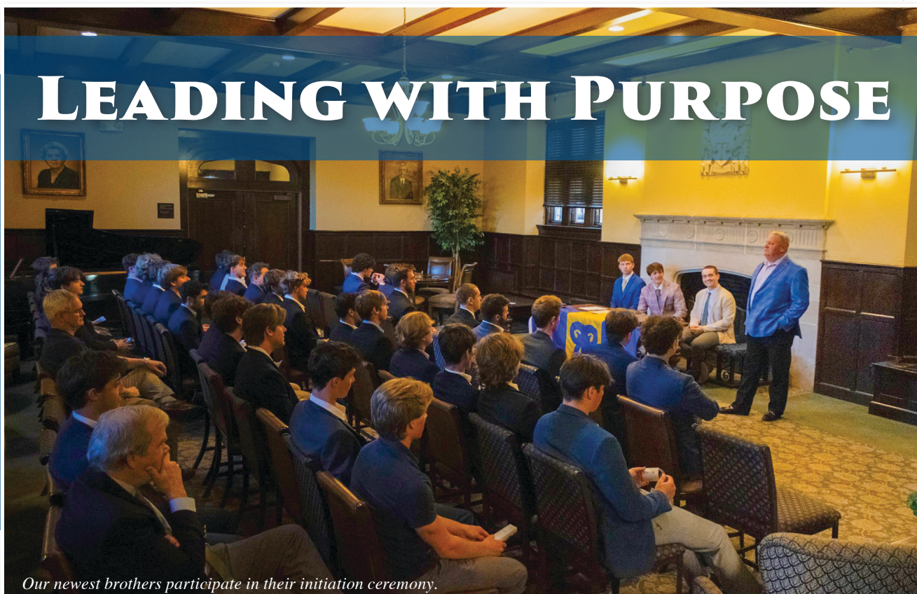
Our newest brothers participate in their initiation ceremony.