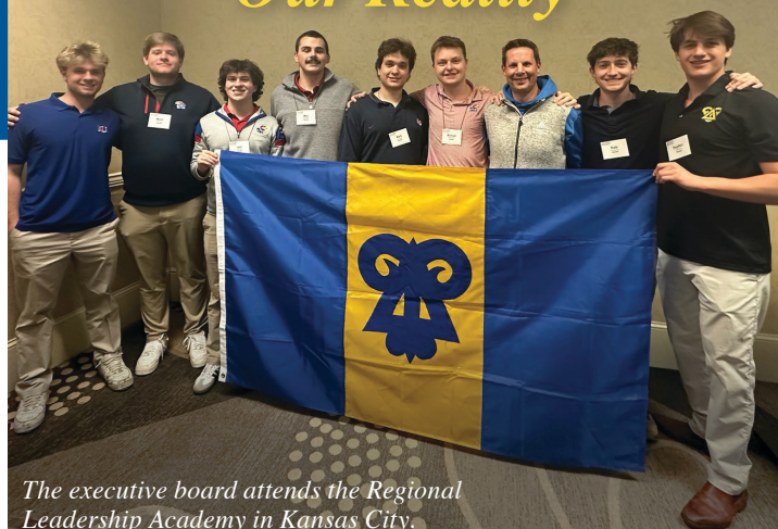
The executive board attends the Regional Leadership Academy in Kansas City.