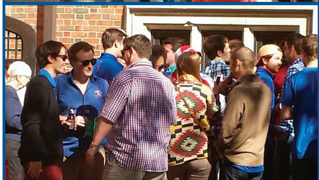
DU alumni, undergraduates, and friends enjoy Homecoming 2013 at the DU house.

While the KU football team turned in a miserable performance at their Homecoming game, Kansas DU posted an impressive win with a tremendous Homecoming event at the Chapter House on a gorgeous Saturday. It was a strong team effort! Here are a few highlights of our efforts and successes: