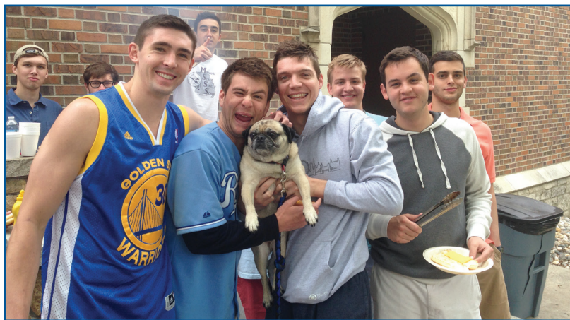
Brothers at our philanthropy event for ovarian cancer this fall.