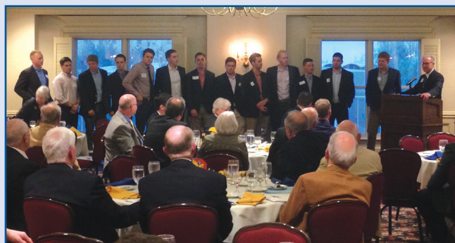
Senior members were inducted into the alumni Chapter after graduation this spring.