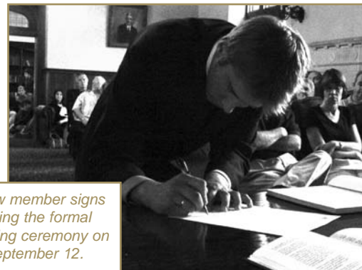
A new member signs during the formal pledging ceremony on September 12.

Blue Valley North H.S. swimming, All-State, All-EKL, All-Metro, All-Johnson County, All-Sun County