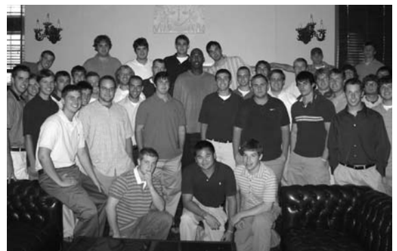
Members of the Chapter were honored to have Danny Manning visit for dinner this semester.