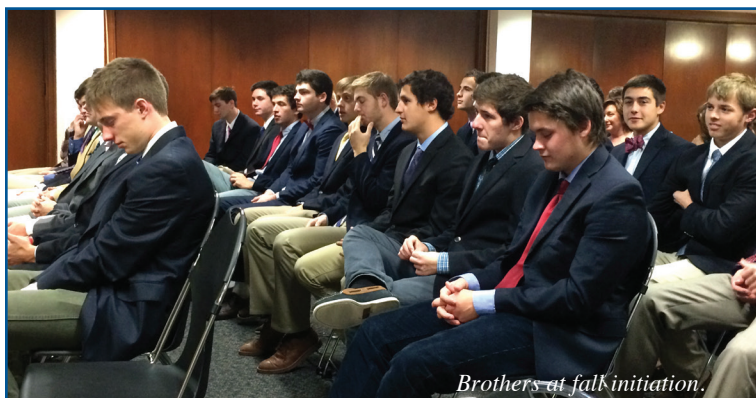
Brothers at fall initiation.