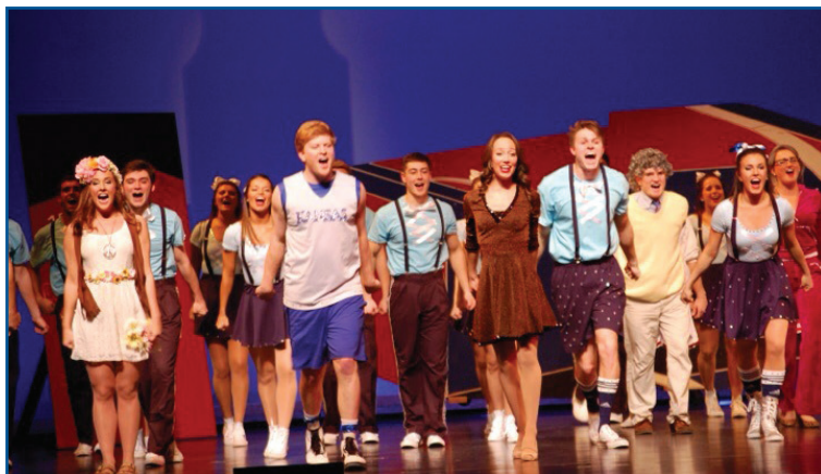
Kansas DU performs in Rock Chalk Revue with Kappa Alpha Theta.