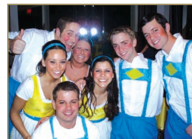
Several Delta Upsilon Brothers, along with their Kappa Alpha Theta partners, stole the show at the Lied Center during Rock Chalk Revue. The performance took Best Show, Best Actor, Best Actress, Best Costume, Best Interpretation of the Theme, Best Chorus, Best Set, and Best Script.