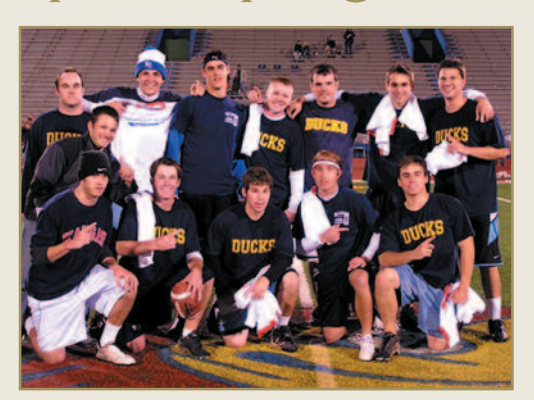
For the second consecutive season, the DU football team brought home another first place trophy for The Hill championship.

Morale is high in the Chapter as we initiated 30 new members into the Fraternity on February 11. This is certainly one of the largest and most tal-