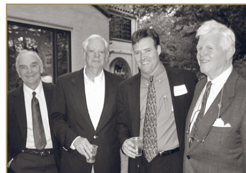
Kansas DU alumni at last year's banquet.