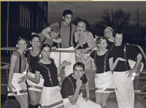
Kansas Chapter and ladies of Kappa Kappa Gamma entertained the Rock Chalk Revue crowd with their performance, Rising Heat.