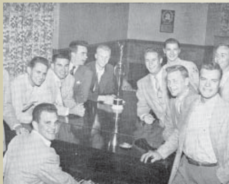
A group of DU Brothers in 1950 gather around the beloved Chickering grand piano in the living room.