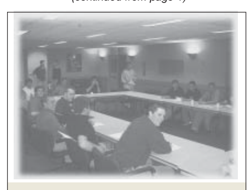
RLS delegates actively participate in a discussion on Recruitment.

programs—our designated driver program, the restructuring of our alcohol policies within the Chapter House, and member education in alcohol risks and issues—have been tremendously effective and we have been publicly recognized for our efforts by the University, receiving the Chapter Excellence Award for Risk