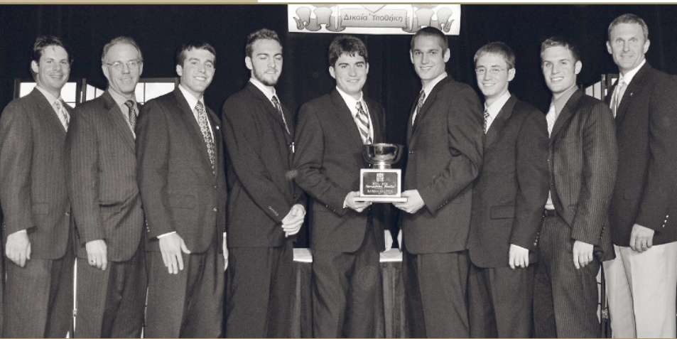
The Kansas Chapter is one of the finalists for the Delta Upsilon Sweepstakes Award—Delta Upsilon's top honor awarded annually to the best DU chapter in North America.

way, our Chapter received awards for outstanding facilities management, community service, and special recognition under the Chapter Excellence Program. On the night of the grand banquet the Kansas Chapter received its most significant honor by being selected as one of the finalists for the Grand Sweepstakes Award.