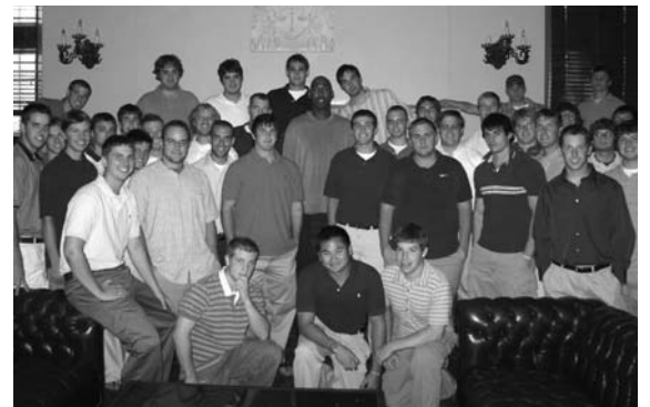
Members of the Chapter were honored to have Danny Manning visit for dinner this semester.