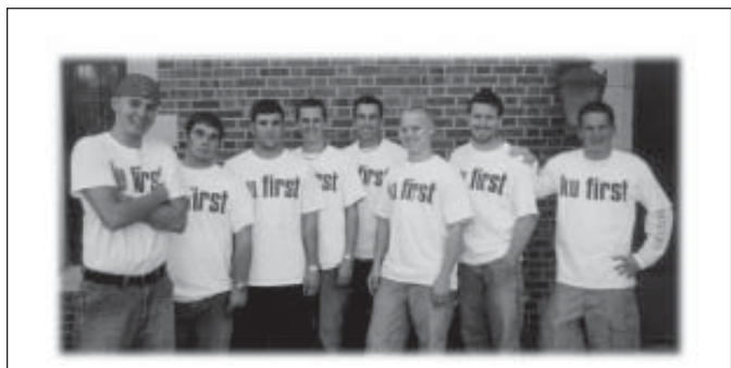
Active members demonstrate their support for the KU First Campaign. Free t-shirts were distributed on campus in early September and 25 students received $1,000 scholarships during the KU-UCLA football game.

With these areas of investment, we can continue maintaining our high expectations—developing young men who desire to leave their own legacy and know that they are better men when they walk through the Campanile on graduation day. We will know that the Kansas Chapter, The University of Kansas, and our society will be an even better place because of their contributions in the future.