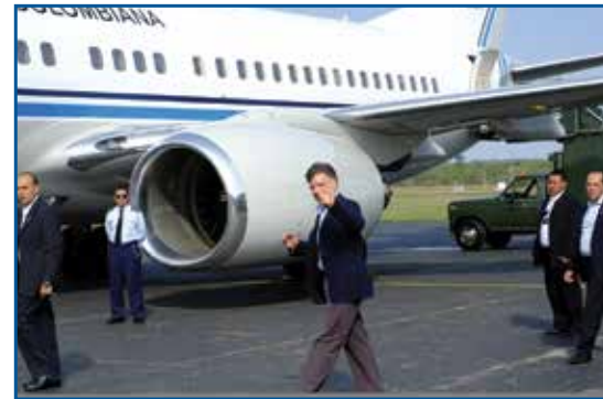
President Juan Santos '73 leaves Lawrence en route to the General Assembly of the United Nations in New York.

Several of President Santos' close DU contemporaries were able to spend about 15 minutes with him prior to the award ceremony and were given exclusive access and reserved seating with other dignitaries. The Colombian