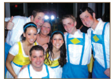
Several Delta Upsilon Brothers, along with their Kappa Alpha Theta partners, stole the show at the Lied Center during Rock Chalk Revue. The performance took Best Show, Best Actor, Best Actress, Best Costume, Best Interpretation of the Theme, Best Chorus, Best Set, and Best Script.