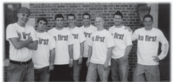
Active members demonstrate their support for the KU First Campaign. Free t-shirts were distributed on campus in early September and 25 students received $1,000 scholarships during the KU-UCLA football game.

With these areas of investment, we can continue maintaining our high expectations—developing young men who desire to leave their own legacy and know that they are better men when they walk through the Campanile on graduation day. We will know that the Kansas Chapter, The University of Kansas, and our society will be an even better place because of their contributions in the future.