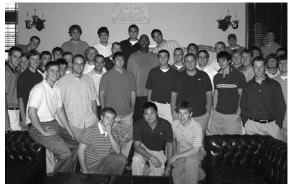
Members of the Chapter were honored to have Danny Manning visit for dinner this semester.